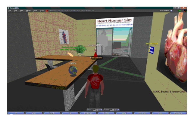
Figure 1 – Screenshot from the 'Heart Murmur Sim - Cardiac Auscultation Training Concept' educational virtual world created in Second Life that allows visitors (clinical students) to tour a virtual clinic and test their skills at identifying the sounds of different types of heart murmurs, based on sound files from McGill University's Virtual Stethoscope (http://sprojects.mmi.mcgill.ca/mvs/mvsteth.htm).

Educause has pages dedicated to Second Life (e.g., http://connect.educause.edu/taxonomy/term/2174/0), which has also been the focus of many recent