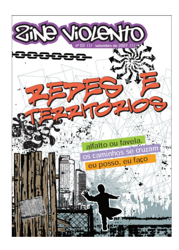
Figure 2 - "Violent Zine" covers.

Each one of the "Violent Zine" issues attempted to make a script based on the speech used by the young individuals of the research, in a symbolic and hypertextual intersection with media materials, music, illustrations, data and academic reflections on the situation of violence against and among the youth, to define directions and interpretations of their perceptions of the world and the incidence of violence.