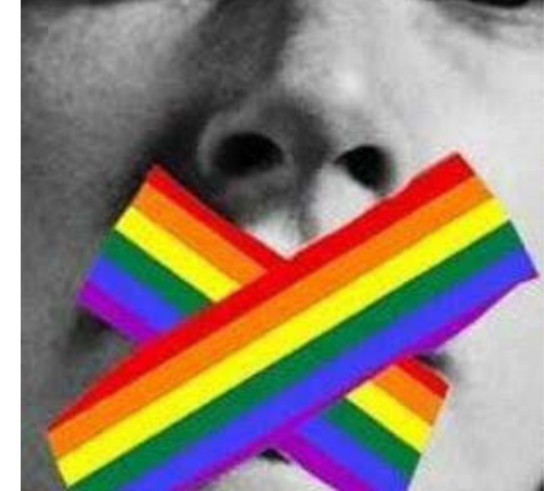
Figure 4 - Profile photo of the "Brazil without gender Figure 5 – Profile photo of the community "No to gay ideology" community<sup>3</sup> dictatorship"