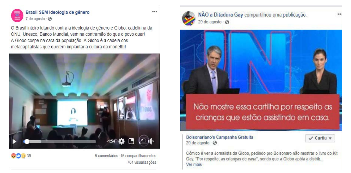
Figure 6 – Community "Brazil without gender ideology"

In the same way that medical-scientific organizations are mentioned for the purpose of legitimizing LGBTI+phobic arguments, others are mentioned as complicit in the supposed implementation of 'gender ideology', or agendas are read as favorable to the LGBTI+ movement. We observed a more combative discourse in relation to Rede Globo, although other international organizations were also mentioned, such as the United Nations (UN), Unesco and the World Bank, endorsing what we identified earlier – the construction of an enemy.