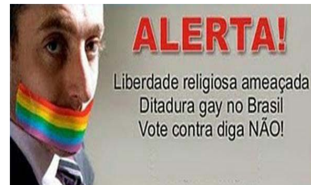
Figure 2 – Cover photo of the community "Brazil without gender ideology"