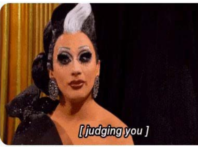
Curtir · Responder · 23 sem